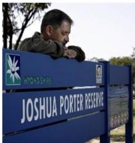
Left: A memorial service for the 15 soldiers who died at High Range in 1996 and Joshua Porter Reserve in Newcastle