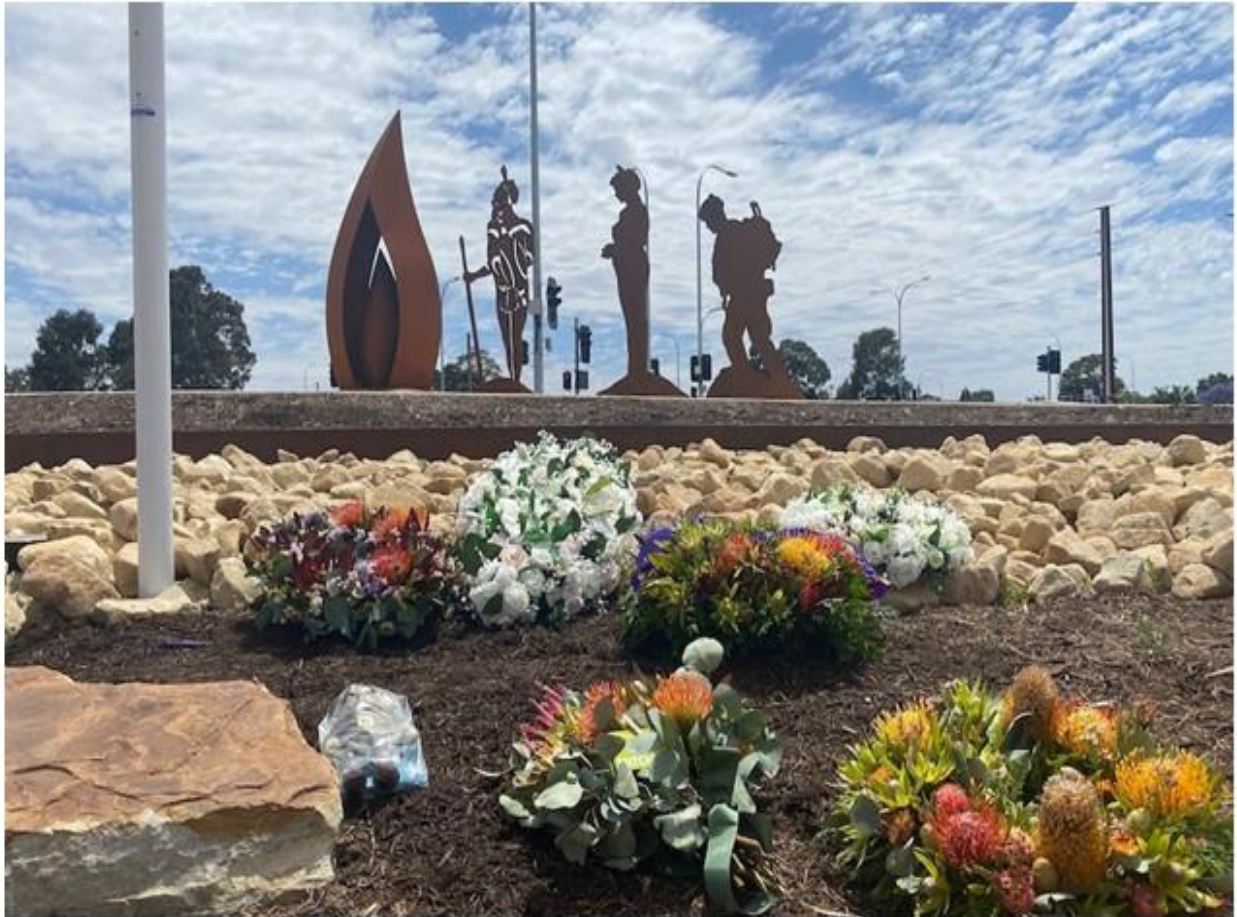
Artwork honouring Aboriginal soldiers past and present installed at Panorama intersection

A new artwork has been installed alongside a busy Adelaide intersection in a move the SA government hopes will help to better recognise the contribution of Aboriginal soldiers who have served Australia at war. The artwork has been permanently installed as part of the Goodwood, Springbank and Daws road intersection upgrade, funded by the state and federal governments.