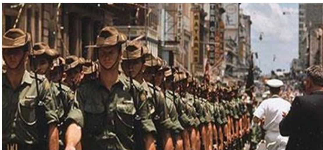
Left: Australian troops in 1973 as part of a 'Welcome Home Parade' held in Brisbane

Australia's service personnel and preserve our wartime heritage, including projects and activities marking the 50th anniversary and the service of Vietnam veterans. These activities will lead into a national commemorative service on Vietnam Veterans' Day, 18 August 2023, recognising the service of all Australians in the Vietnam War and honouring the sacrifices that they and their families made. The service will be held at the Australian Vietnam Forces National Memorial on Anzac Parade in Canberra.