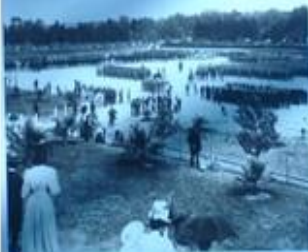
The return of the first Boer War contingent, c. 1900.

The banks of Karrawirra parri, called the River Torrens by the South Australian colonists, have long been important to the local Indigenous people, the Kaurna.