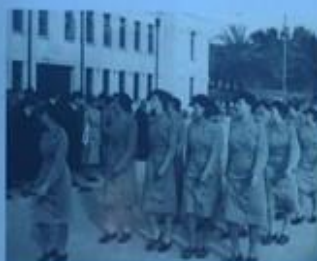
Second World War transport drivers at Torrens Parade Ground in 1943.