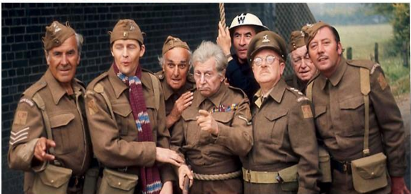
The original Dad's Army Cast

A statue of Arthur Lowe dressed in the uniform that he wore in his role as Captain Mainwaring, seated on an elegant wooden bench, with his back to the river.